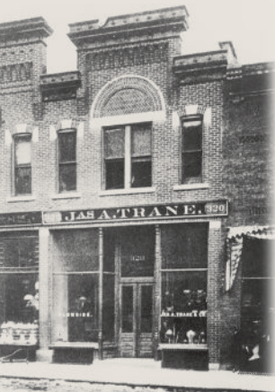
Trane Storefront La Crosse, Wisconsin 1891

Trane has a tradition of quality lasting more than a century.